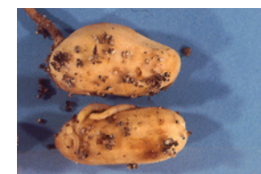
Southern corn rootworm