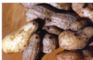
Southern corn rootworm damage